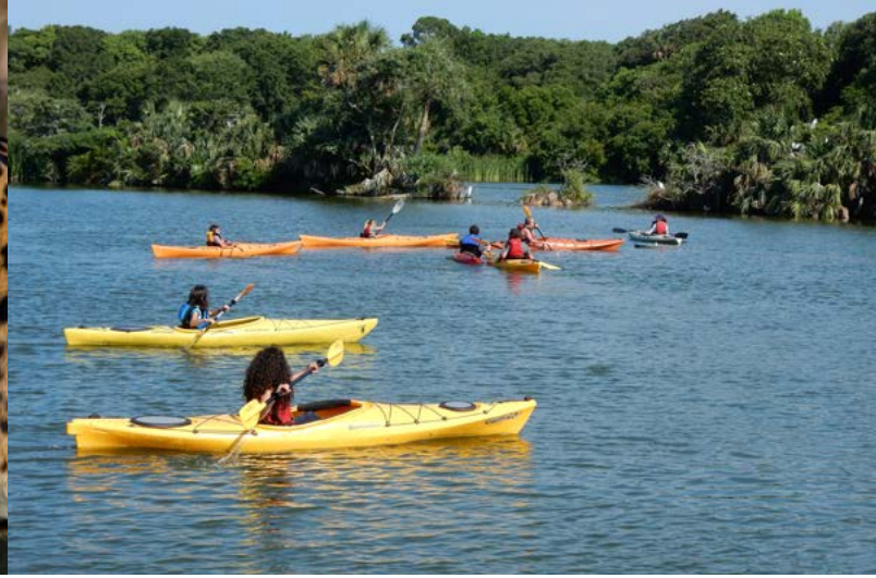
Adventure Kayak Florida