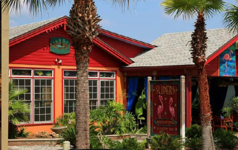
Sliders Seafood Grille