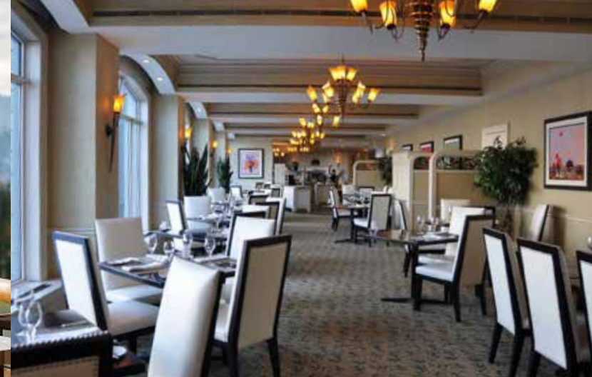
Primrose Dining Room