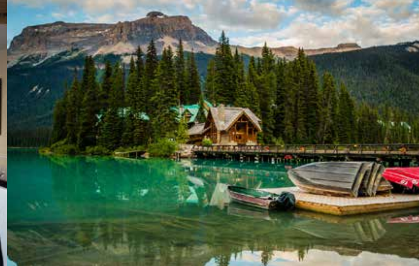
Mountains, Lakes and Waterfalls Tour