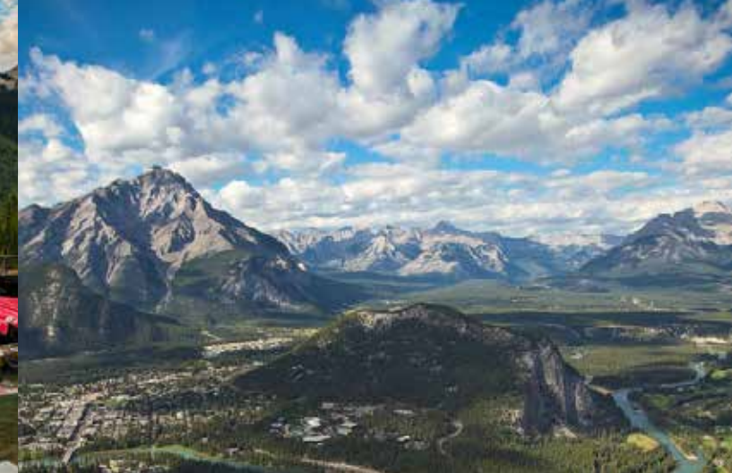
Explore Banff Tour