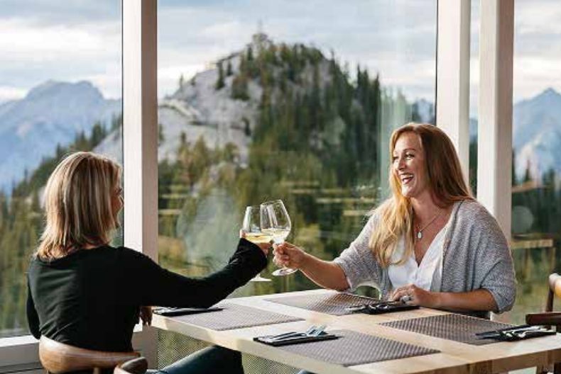
GI Sky Bistro